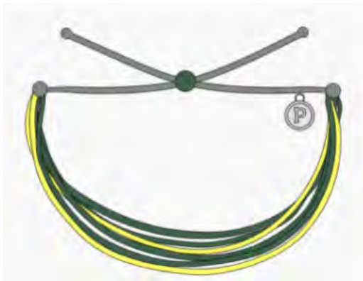
actual bracelet may differ slightly; illustrative only